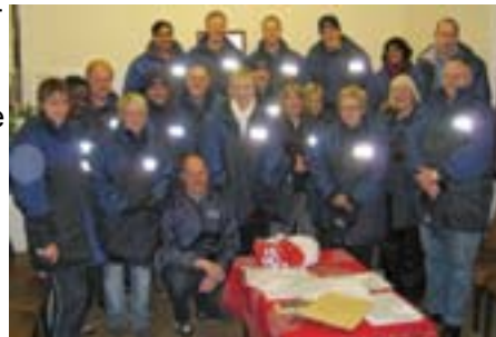
First night team photo

Why not become part of this amazing work of God within our city?